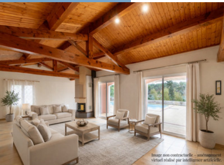
Image non contractuelle - aménagement virtuel réalisé par intelligence artificielle.